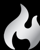
HOPE $7 p/m