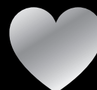
CHARITY $7 p/m